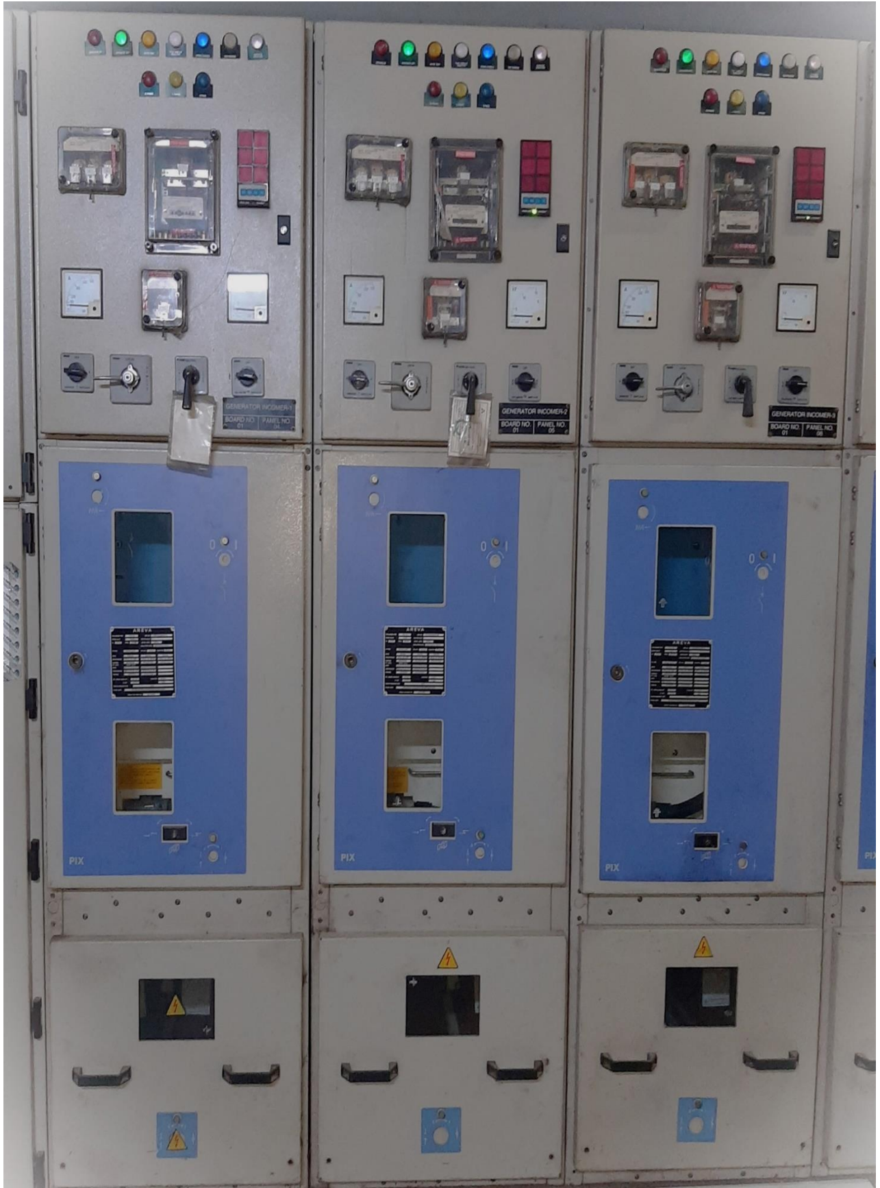
Figure-1: 1250A SF6 Panel

Sample Pictures of Circuit Breaker Panel are reference only.