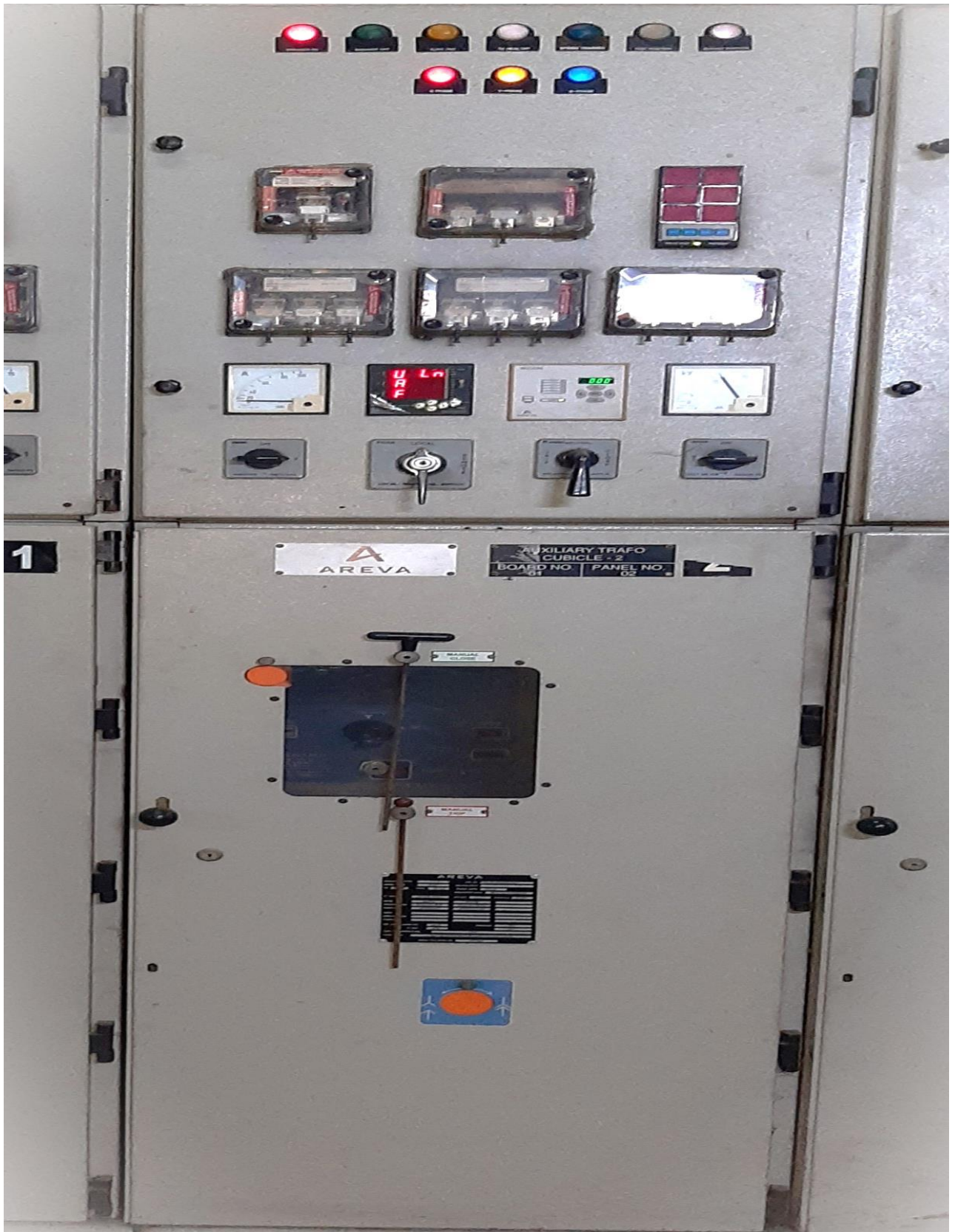
Figure-3: 1250A VCB Panel