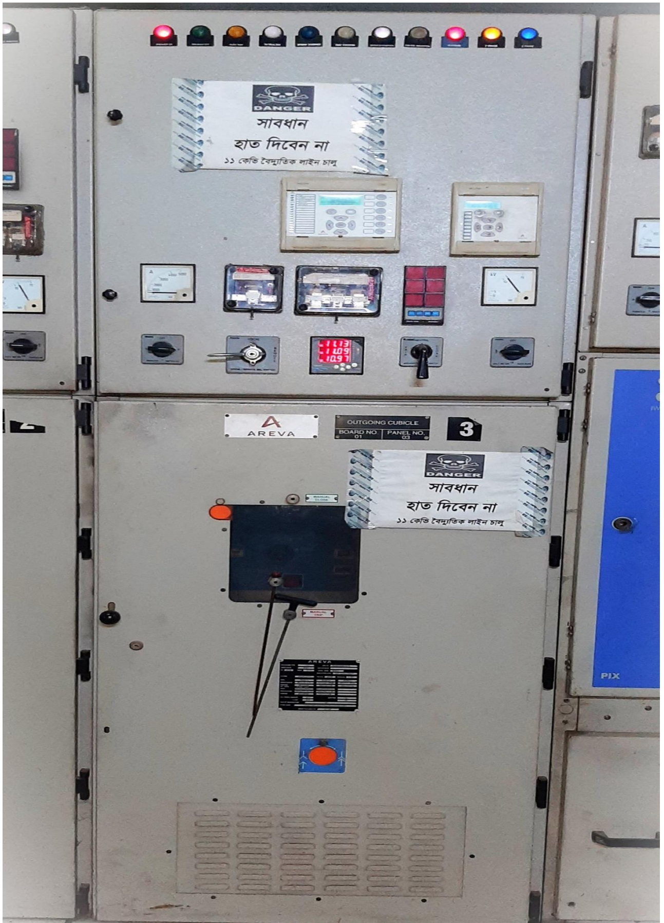
Figure-2: 5000A VCB Panel