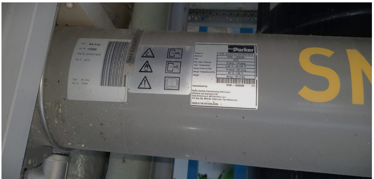
Figure: Membrane of Nitrogen Generation Plant (NGP)