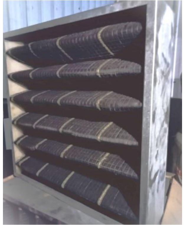
Figure-F: Fine Filter Chevronet