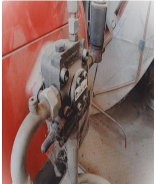
Figure-B: Burner Pump