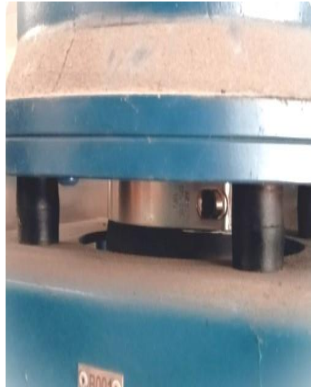
Figure-D: Oil Mist Separator Isolator