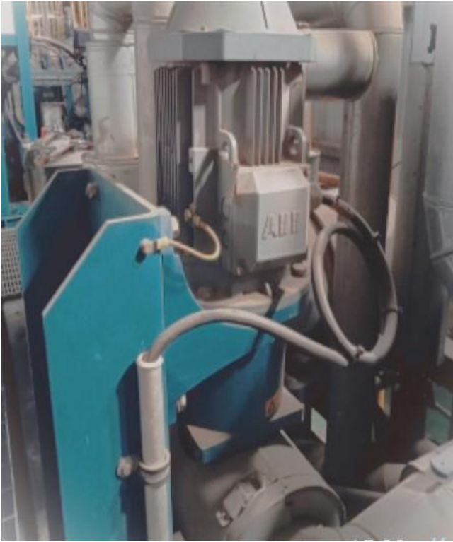
Figure-E: Fuel Booster Unit Screw Pump, Assembly