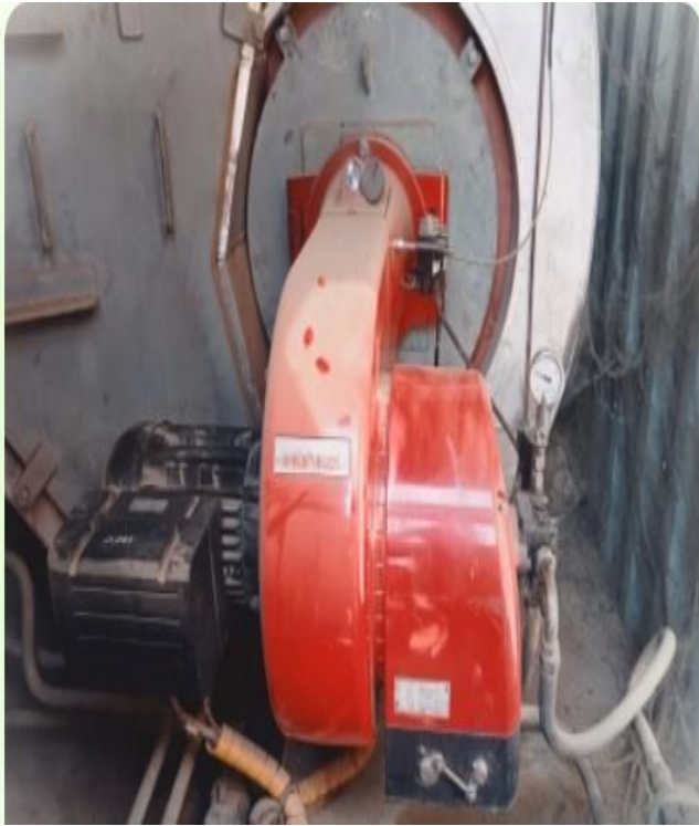
Figure-A: Burner Fan Wheel

Sample Pictures of Spare Parts are reference only.