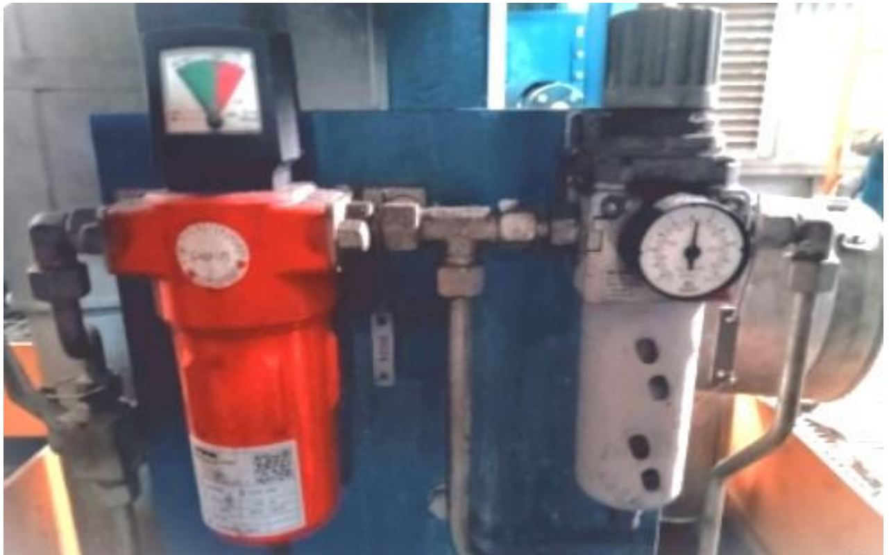
Figure-G: Air filter, Complete & Pressure Regulator, Complete