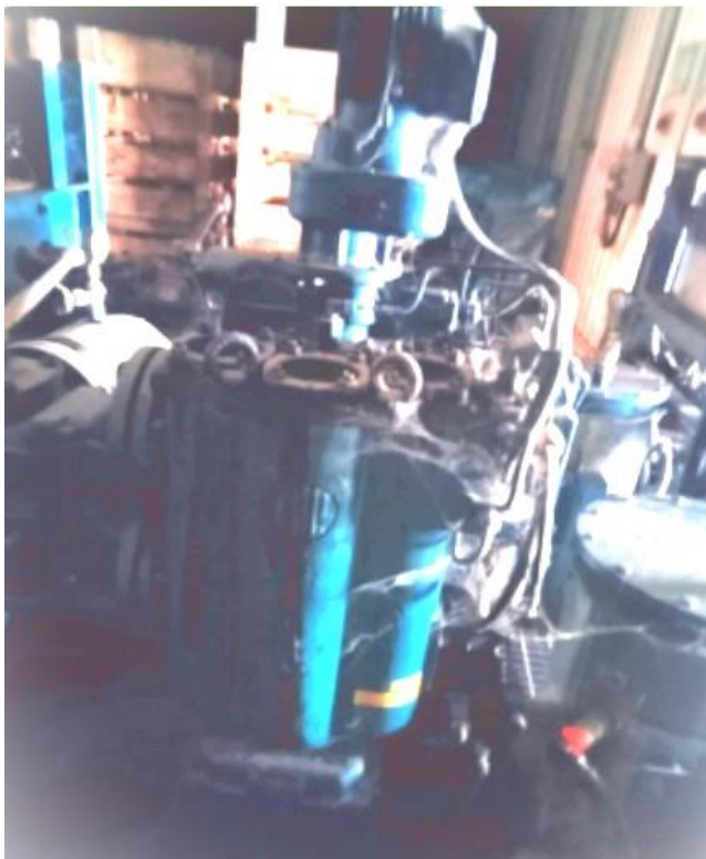
Figure-C: Automatic Filter Candle