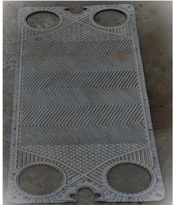
Figure-B: Heat Exchanger Plate (LT)