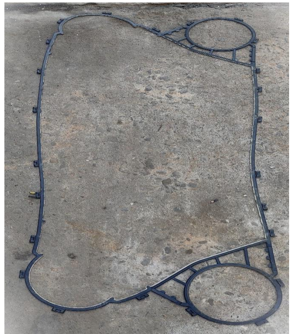
Figure-D: Gasket for LT Cooler Plate