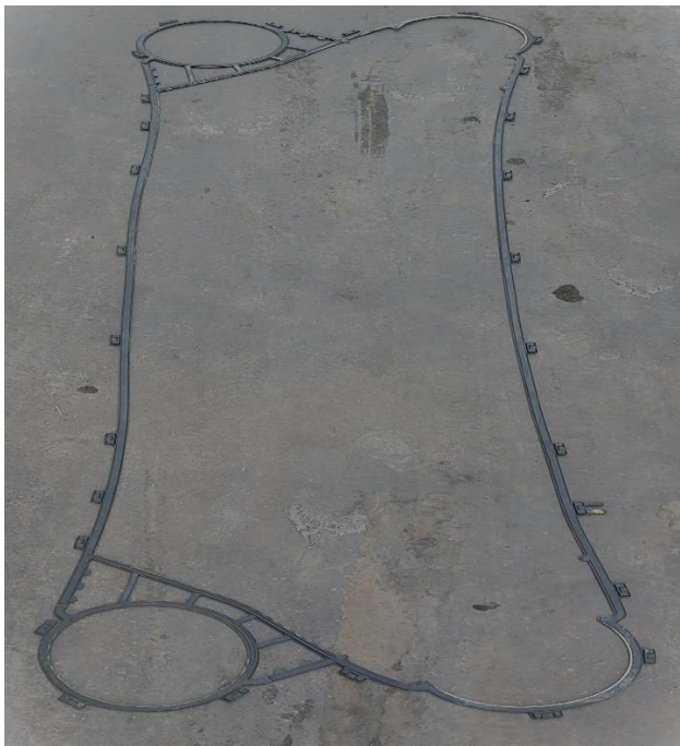
Figure-C: Gasket for HT Cooler Plate